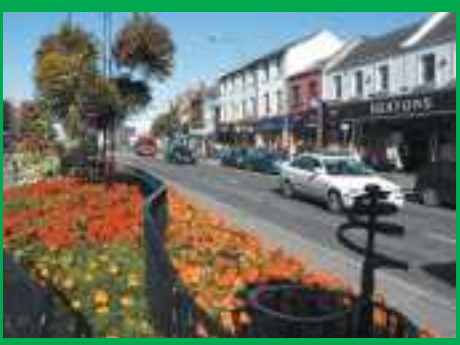
Lurgan resurgence - see page 3