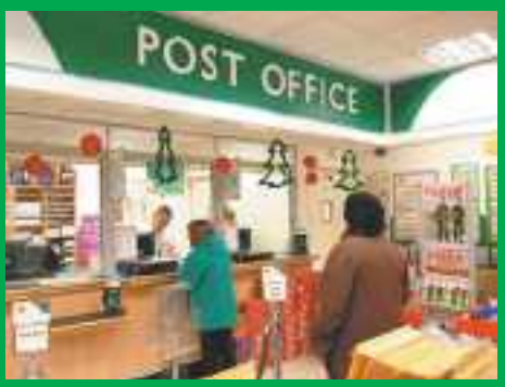
A Complete Shambles - see page 4