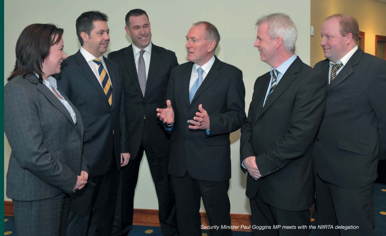
Security Minister Paul Goggins MP meets with the NIIRTA delegation