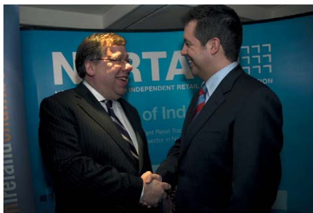
SDLP Conference in Newcastle where NIIRTA and the Northern Ireland Chamber hosted a reception to highlight the key challenges facing the local economy

Taoiseach Brian Cowan TD attended the NIIRTA Reception at the SDLP Conference