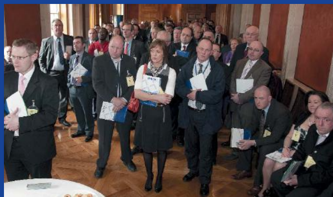
NIIRTA members and guests at the 10th Anniversary reception in Stormont